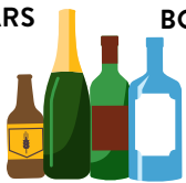
WINE, BEER & SPIRIT BOTTLES