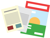
JUNK MAIL & MAGAZINES