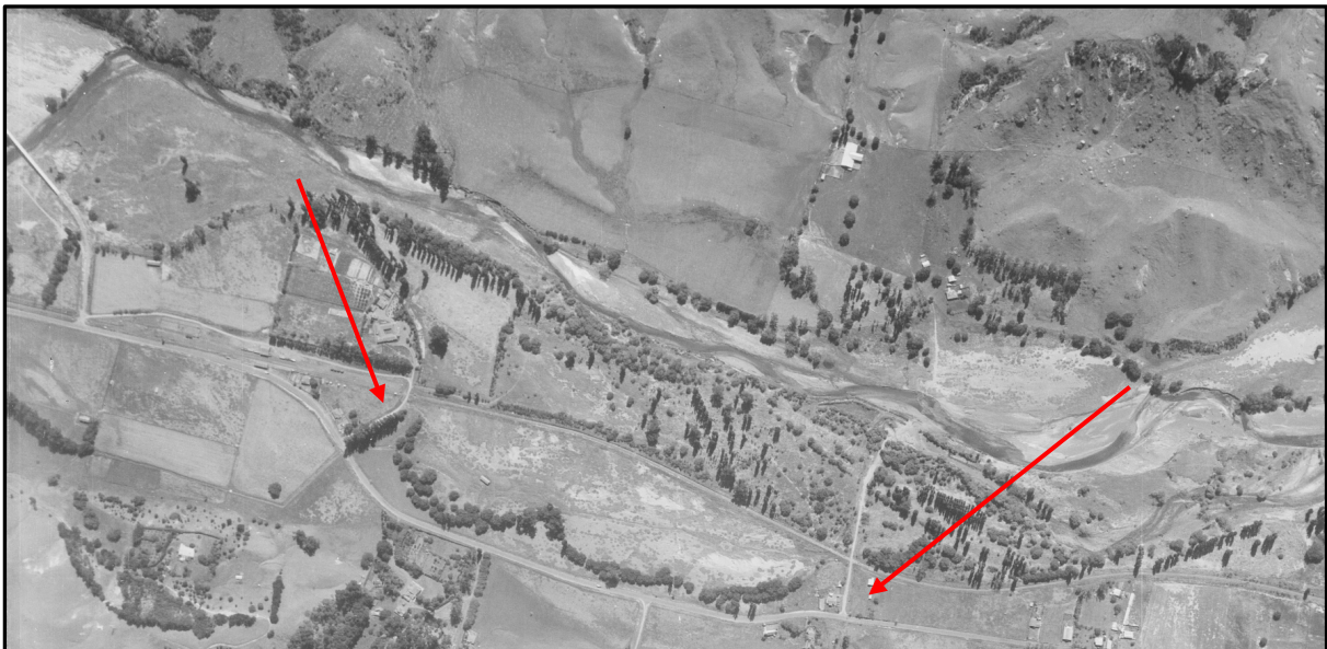
An excerpt from a Retrolens 1943 aerial showing Yule and Shaw Roads (arrowed).

A 1988 image shows the Esk Park area beginning to take a form more similar to that seen today. A circle of trees to the east many of which remain today can be seen, as can the access way that currently runs through the park.