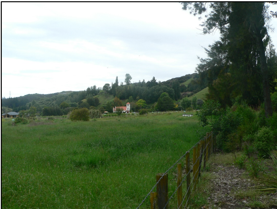
View from public area of Esk Park across leaed paddocks towards SH5 and the Esk Church.

No evidence of archaeological features or materials were noted during the site visit. No occupation or activity indicators such as burnt stone, shell, or charcoally soils were noted in the exposed surfaces around the mature trees. Nor has any such material been reported during any of the planting activity that has occurred in recent years.