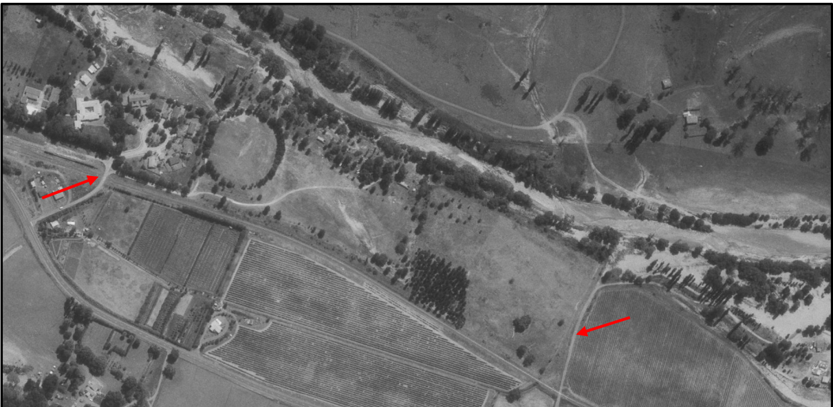
An excerpt from a Retrolens Nov 1988 aerial (post Cyclone Bola) showing Yule and Shaw Roads (arrowed): note the circle of trees.

Historical images from the Napier MTG were scanned, and although none were found that related specifically to the Esk Park there were several images relating to significant flood events in 1924 and 1938 where it is understood that several metres of silt was deposited across the wider Esk Valley area.