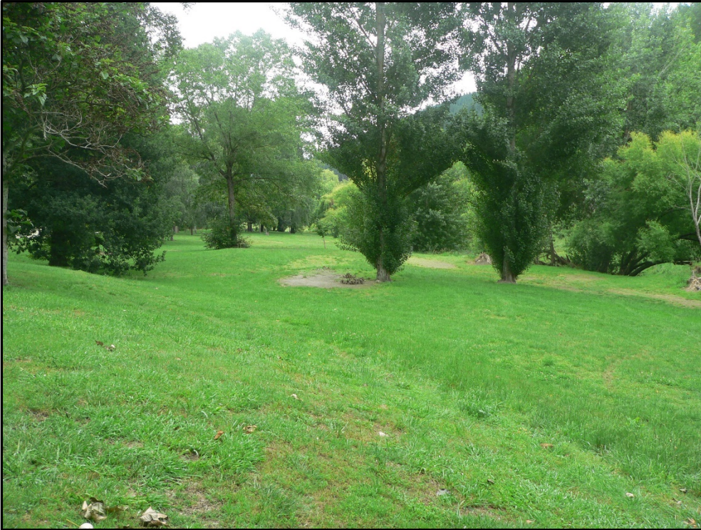
Series of terraces dropping from the main park level down towards the river.