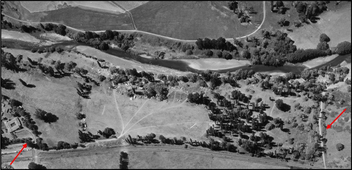
An excerpt from a Retrolens 1969 aerial showing Yule and Shaw Roads (arrowed): note the large number of vehicles parked amidst the trees.