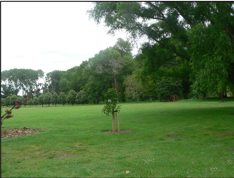
General view of the park from eastern boundary: note trees lining the access road and the mix of very mature trees and recently planted saplings.