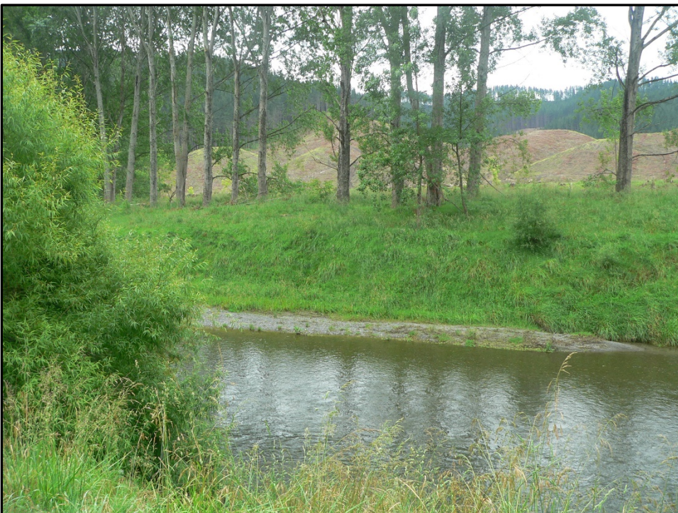
Esk River channel looking across to the PanPac forests.