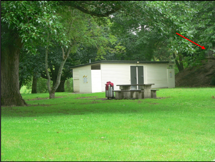
Toilet block with artificial mound (right of image) atop which sits a water tank (arrowed) – note maturity of trees growing on the mound.