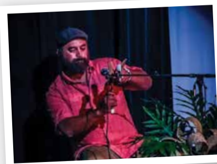
WHAT'S ON IN MAY