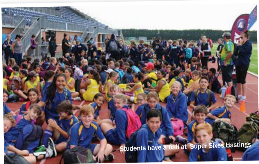
Students have a ball at Super Sixes Hastings

It's quick and easy to register online at hastingsdc.govt.nz/dog-registrations or you can also register at the Council office on Lyndon Road East, Hastings.