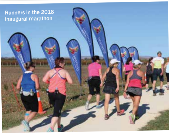
Runners in the 2016 inaugural marathon