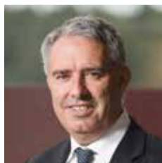
MAYOR LAWRENCE YULE