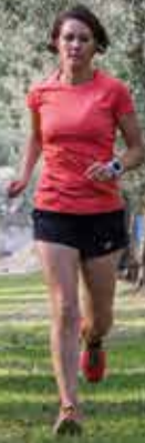
Marathon course takes runners through scenic olive groves