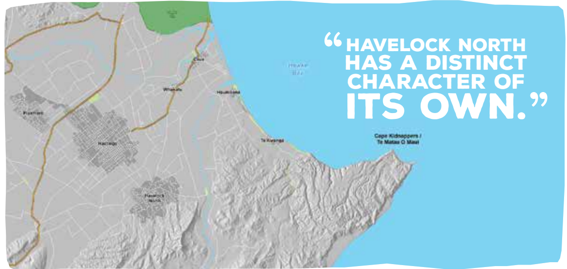
Figure 1: Map showing Havelock North in relation to Hastings city.

A wide variety of early childhood education / preschool options are available locally, including kohanga reo, playcentre, kindergarten and other childcare providers.