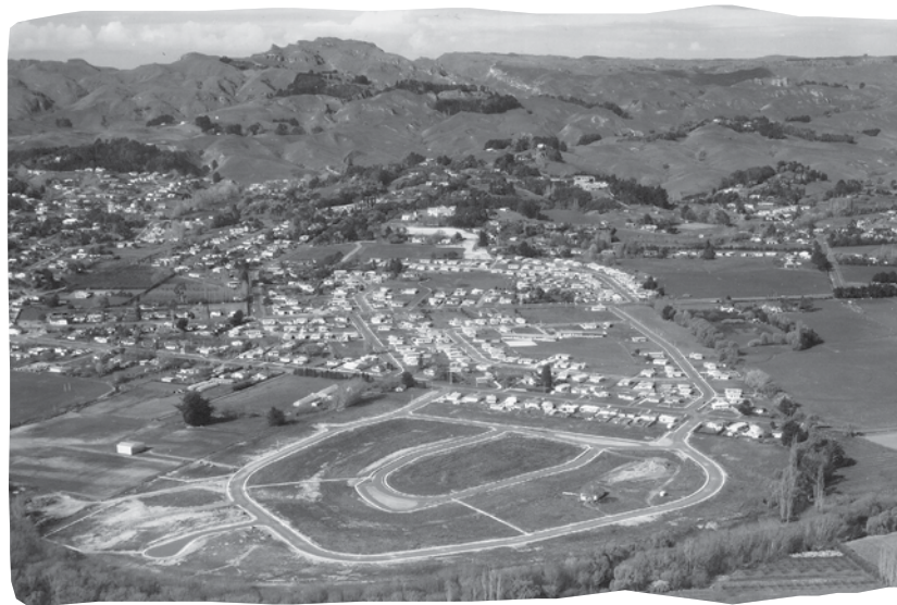
Figure 2: Havelock North August 1963 with Te Mata o Rongokako in the background

Tradition personifies Te Mata Peak as the face of Rongokako, thus Te Mata o Rongokako (Te Mata may be translated as face). Rongokako was the grandfather of Kahungunu (ancestor of the local hapu). He is also sometimes called "the sleeping giant".