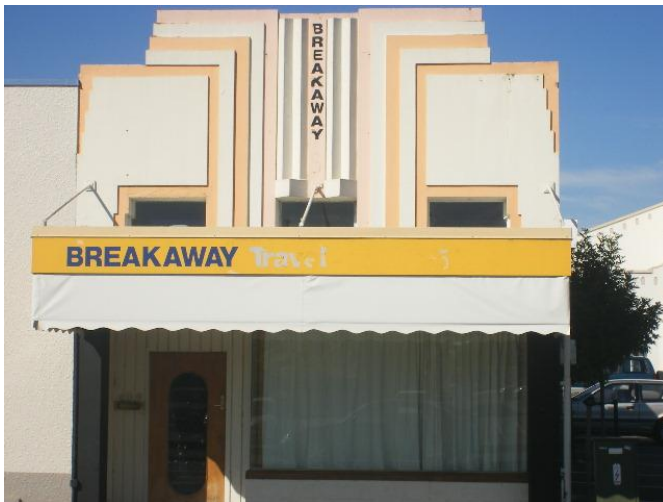
409 Heretaunga Street when it was occupied by Breakaway Travel