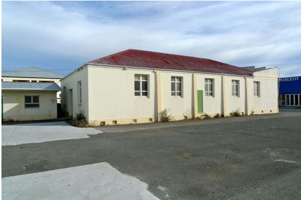
View from north-west, showing rear elevation and shed, 2012

Draft: 16 August 2007, updated December 2009, updated July 2012 (Cochran & Murray); Final Report: November 2012