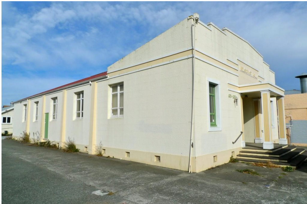
View from north-east, showing the modeling of the front and side elevations, 2012.