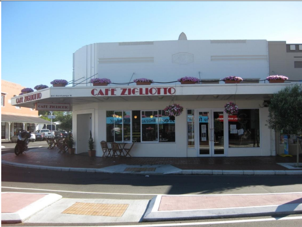
E & K Building, Heretaunga Street East view (Sarah Akers, 2009)