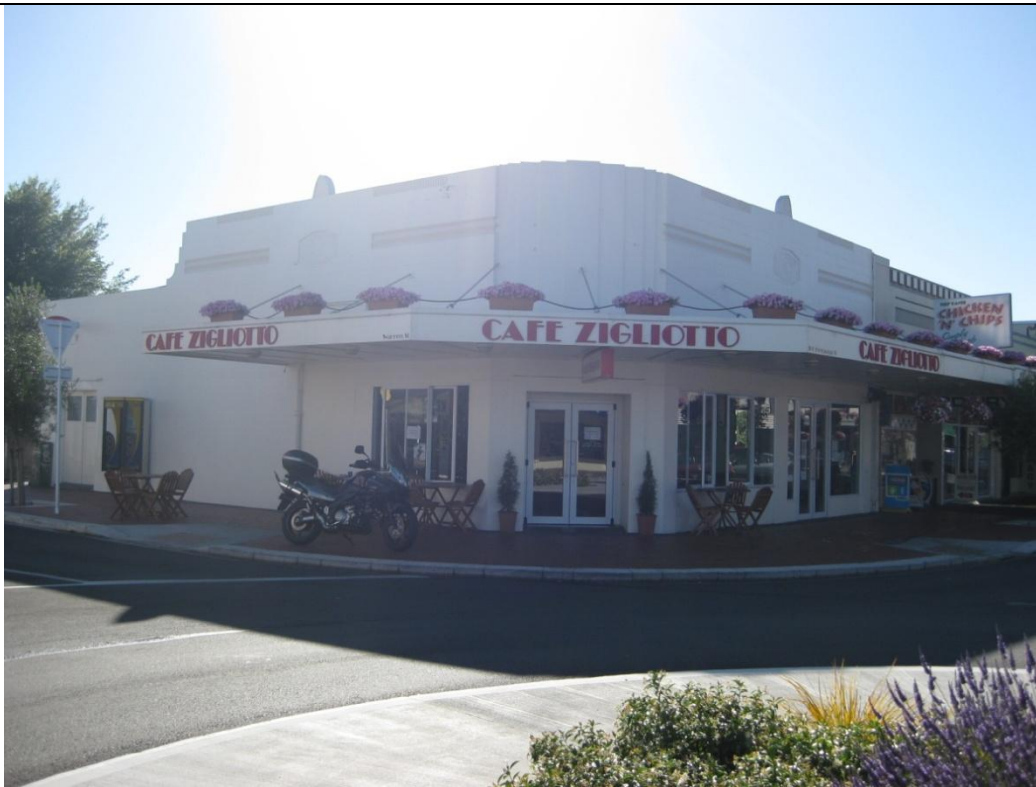
E & K Building, Warren Street North view (Sarah Akers 2009)