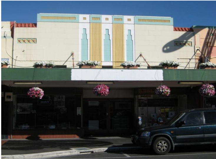
Building 2, Commercial Group #3 (S. Akers, 2009).