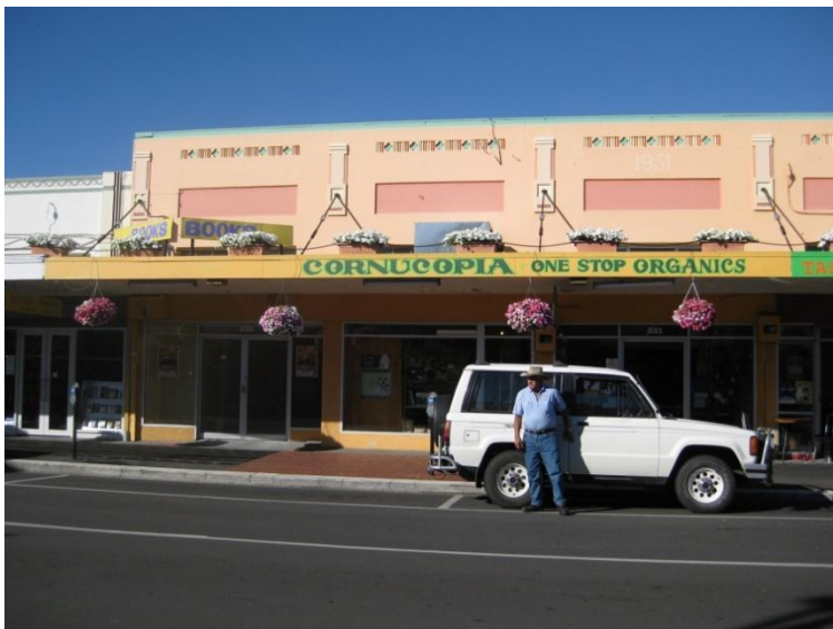
Eastern side of Building 1, Commercial Group #3 (S. Akers, 2009).