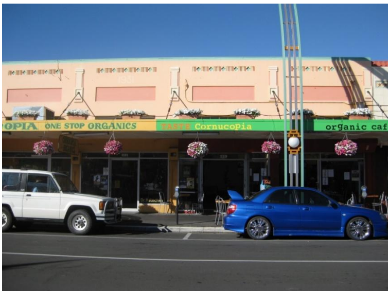
Western side of Building 1, Commercial Group #3 (S. Akers, 2009).