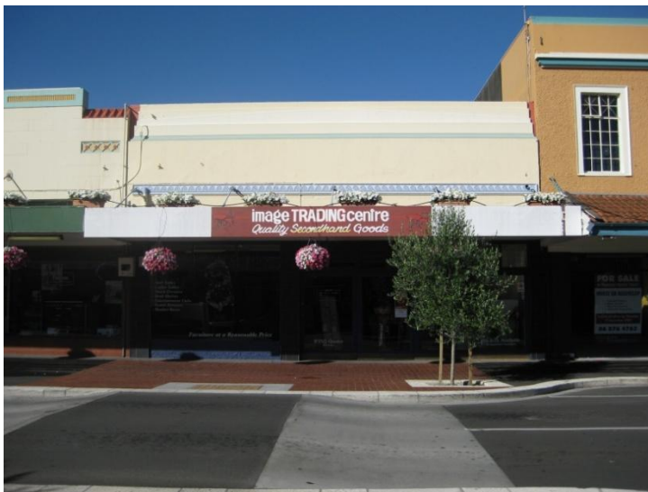
Building 3, Commercial Group #3 (S. Akers, 2009).

Street and Number: 217 Heretaunga Street East (Building 1), 215 Heretaunga Street East (Building 2), 211 Heretaunga Street East (Building 3)