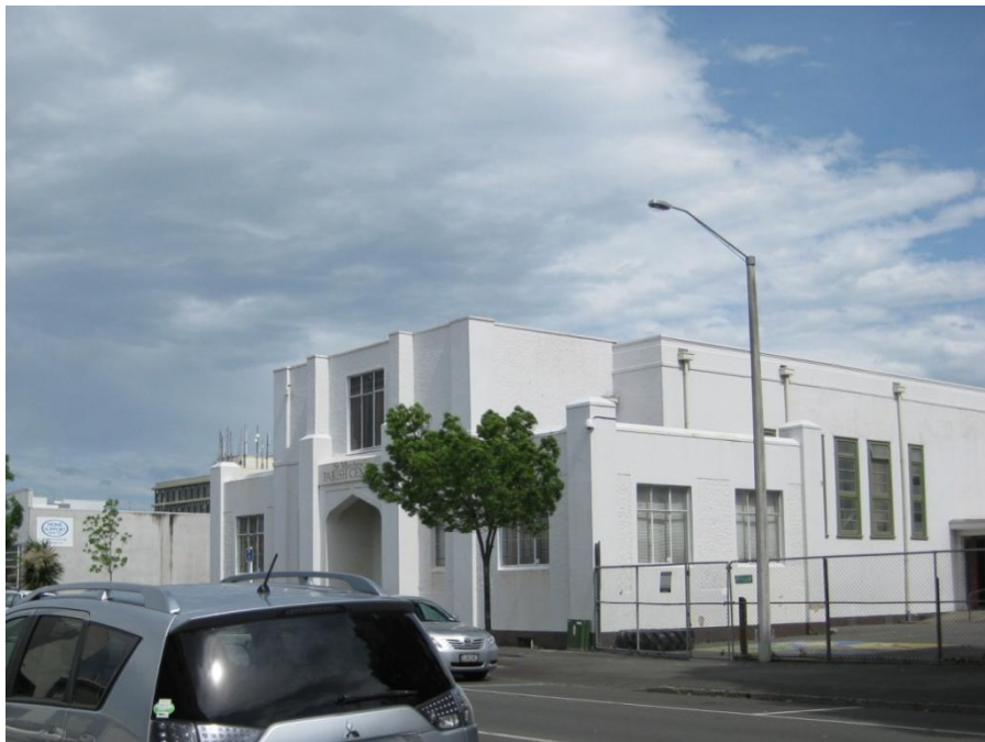
West Elevation (2012)