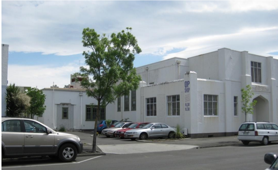
East Elevation (2012)