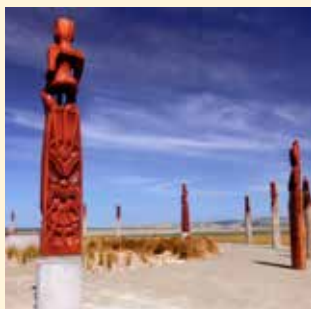
Waitangi Regional Park

This trail traverses 20.0km and can be driven or cycled.