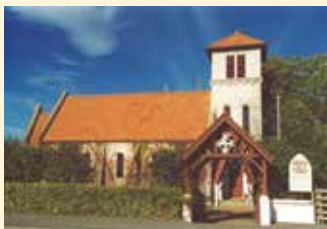
Esk Valley Church

Allow 1¾-2 hours driving time plus optional side trips.