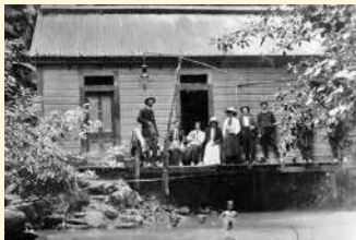
The Bath house, Morere, Wairoa