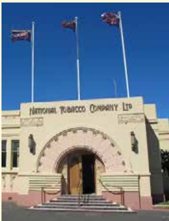
Front Entrance, National Tobacco Company

This trail is in two parts; allow 30 minutes for stage 1, and 55 minutes for stage 2.