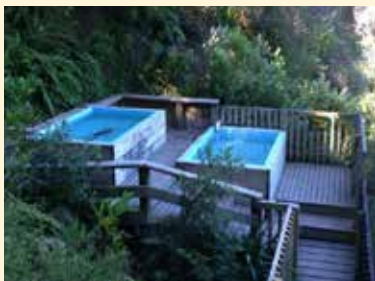
Mangatutu Hot Springs

The trail is 193 km long and can be driven in 4 hours but allow a full day to enjoy all the sites.