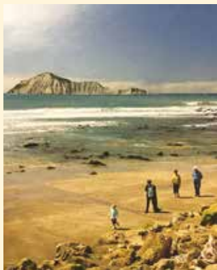
Waimarama and Bare Island

Beginning in Hastings the Waimarama Trail is almost 100 km long and links many sites of interest to Waimarama Beach southeast of Hastings. Sites to explore on this trail include the Mata Trust Park, an 1892 hydroelectric power station, Maraetotara River, Ocean beach and and Cape Kidnappers Gannet Colony.