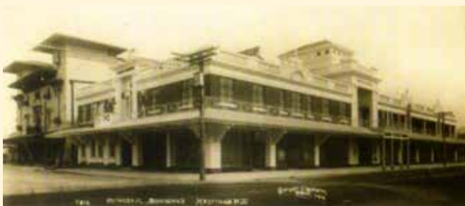
The former Municipal Theatre and Buildings. Now the Hastings Opera House and Municipal Buildings

Starting from the i-Site located in the beautiful old Westerman's building on the corner of Heretaunga and Russell streets in the centre of Hastings, the drive takes travellers on a 38 km journey through Hastings urban area and the outskirts of the city to give them an appreciation of the historic interdependence between the fertile horticulture/agriculture soils and the market town which developed as a result. The beautiful parks donated by the city fathers and the interesting mixture of architectural styles link well together with the industrial heartbeat of the town.