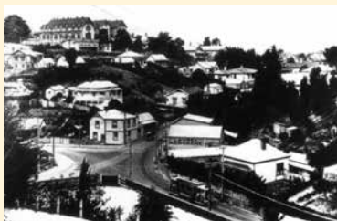
Corner of Coote St & Shakespeare Rd c.1916

Allow 2-2½ hours excluding optional walks.