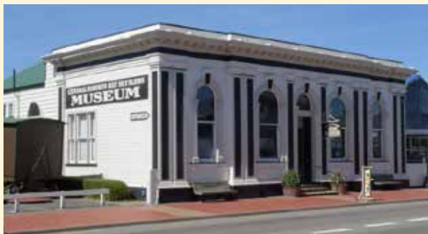
Central Hawke's Bay Settlers Museum