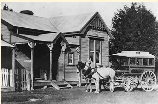
Havelock North Post Office 1911.