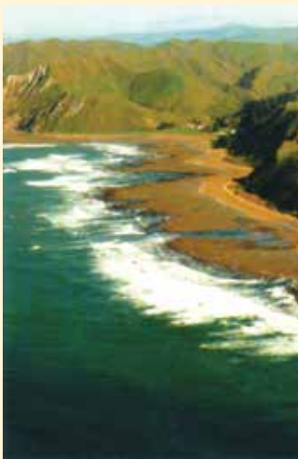
Te Angiangi Marine Reserve Coast

Allow 4 hours to drive the trail and a complete day to explore the sites.