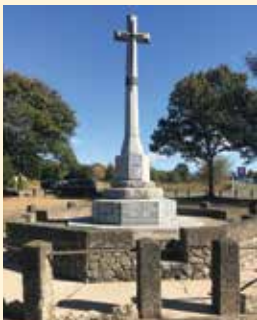
Maraekakaho War Memorial

This trail takes you westwards from Hastings towards the Ruahine mountains through a variety of farmlands including the Gimblet gravels, one of the finest wine growing areas in New Zealand, the highly fertile river flats of the Ngaruroro River and the rolling farmlands which have traditionally carried large flocks of sheep and cattle. There are many historic landmarks reflecting the growth of the district from very early days. It is well worth a day's drive.