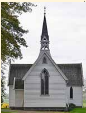
Christ Church Pukeko 1859

The trail can be driven from either direction. Allow 2 hours to drive the trail and a full day to explore all the sites.