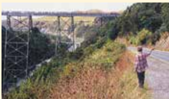
Mohaka Railway Viaduct

Allow 1 3 / 4 -2 hours driving time plus optional outside trips.