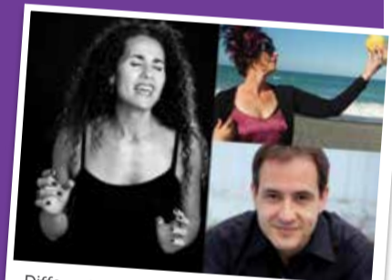
Different worlds: A look at the different worlds that poetry and music can open up.

"They are all very special; I think it's best if we all see as many as we can."