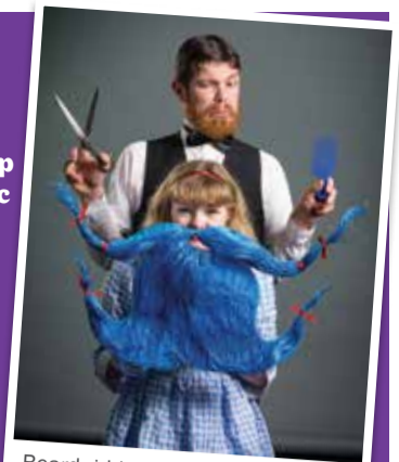
Beard-riden: Trick of the Light Theatre presents Beards, Beards, Beards.

Australia's finest flamenco troupe breathes new life into this traditional art form. Delighting audiences at festivals in New Zealand and Australia, this troupe will be lifting the roof.