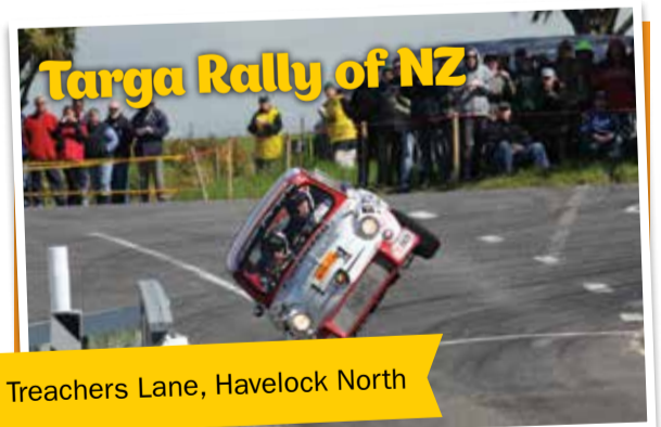
Treachers Lane, Havelock North

Anderson Park, Te Aute Road, Havelock North This is Hastings' only public Guy Fawkes celebration and there will be gourmet burgers, hot dogs, chips, lollies, coffee and drinks for sale. There's also a Classic Hits family disco before the fireworks. Tickets on sale at Havelock North Primary School. 6pm - 9pm