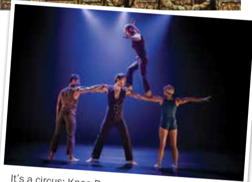
It's a circus: Knee Deep Casus Circus, billed as Australia's hottest new circus company.

Back in the Spiegeltent the range of shows is mind-boggling; from Brazilian songstress