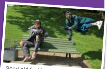
Good old fashioned fun: Betsy and Mana Productions presents Double Derelicts – White Face Crew