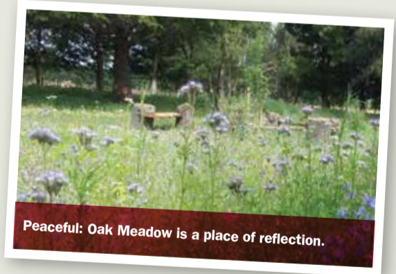
Peaceful: Oak Meadow is a place of reflection.

The meadow has been designed as a place of reflection in a natural, beautiful and peaceful setting, Bowles says.