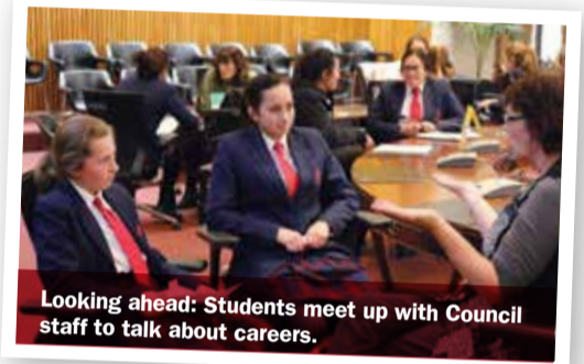
Looking ahead: Students meet up with Council staff to talk about careers.

A report published by the Education and Employers Taskforce showed that young people who have four or more contacts with employers while they are at school are five times less likely to be unemployed once they leave school.