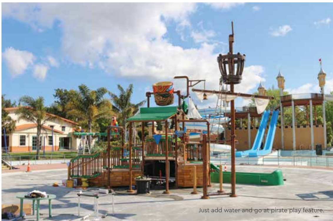
Just add water and go at pirate play feature.