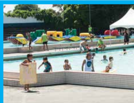
HASTINGS POOLS OPEN