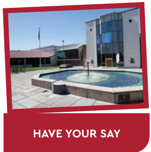
HAVE YOUR SAY