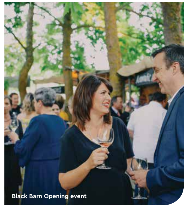
Black Barn Opening event

On the coast, Cape South, Clearview Estate, Millar Road, and Outfoxed are hosting a diverse range of delicious experiences, while the walkers among us can join a guided coastal trek commencing at Clifton and heading overland towards spectacular views and a well-earned lunch.