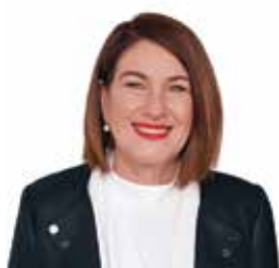
MAYOR SANDRA HAZLEHURST