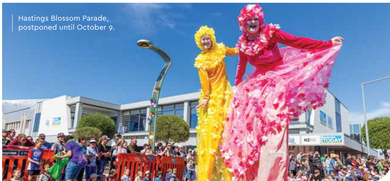
Hastings Blossom Parade, postponed until October 9.

The Hastings Blossom Parade scheduled to take place on September 11 has now been postponed until October 9 with the move to COVID-19 Alert Levels 4 and 3.