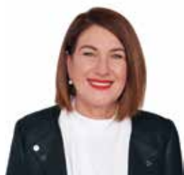
MAYOR SANDRA HAZLEHURST