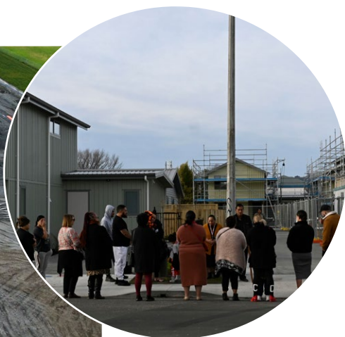
Pictured above: New Kāinga Ora homes being blessed at Jellicoe Street.