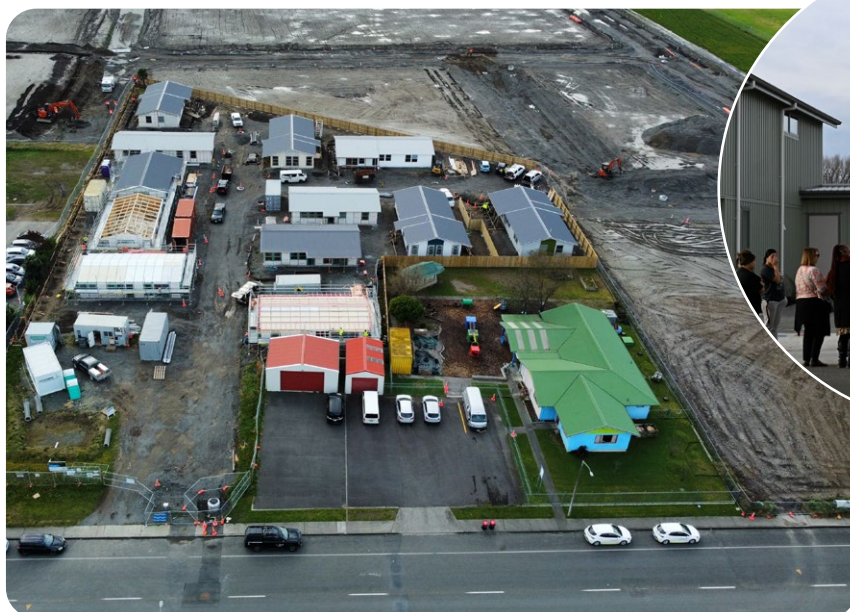
Pictured above: Wesley Community Action and the Hastings Samoan parish have joined forces to build 12 homes in Flaxmere.

The Waingākau vision is to create a nurturing community, where everybody knows their neighbours. This is creating a safe place to raise healthy tamariki, as Waingākau expands into Stages 6 and 7 around Te Aranga Marae.