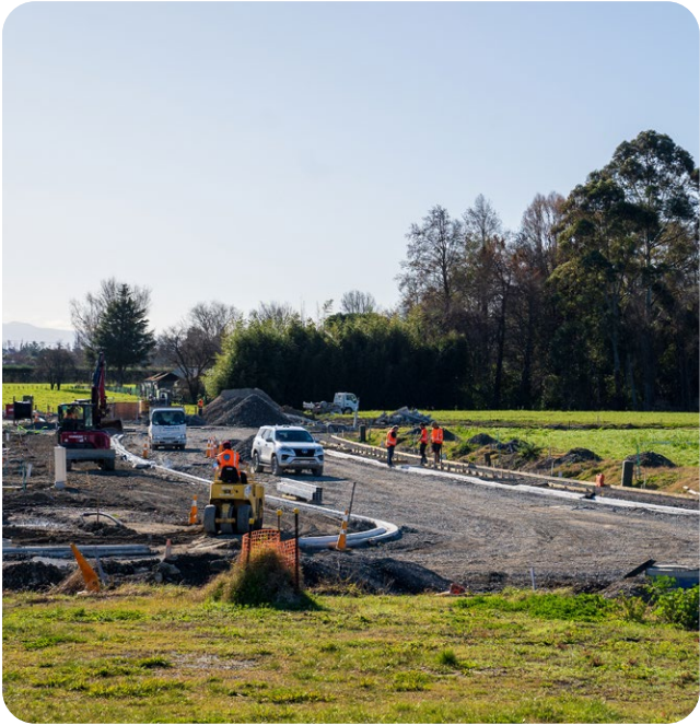
Pictured above: Building is starting on the first lot of homes planned along Brookvale Rd.