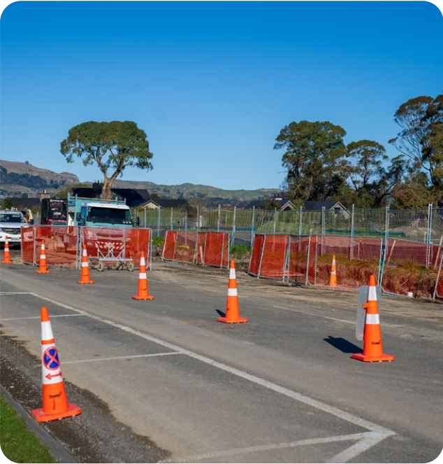
Pictured above: About 250 to 300 houses are planned for the Howard St development.

This area is mostly subdivided, with development progressing slowly on the last 20 remaining sections