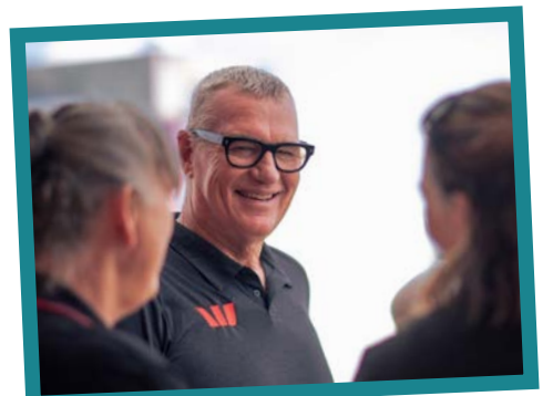
SIR JOHN KIRWAN LEADS SUPPORT