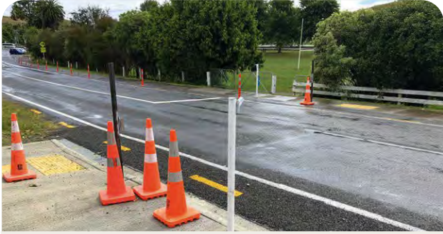
A new crossing to improve safety on Puketapu Rd to access the school is substantially complete.

The contract for the permanent replacement of the Puketapu Bridge has been awarded, with construction due to start by May 2024.