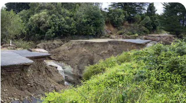
The washout of the Crystal Twin culvert left a 35 metre gap in the road (March 2023)

The construction of a new culvert to replace the severely damaged Crystal Twin culvert on Matahorua Rd is underway. The project has taken significant planning given the damage included a 35 metre gap in the road and major drop-outs and slips. Construction of the new, larger culvert with a new road built over it is expected to be completed mid-2024.