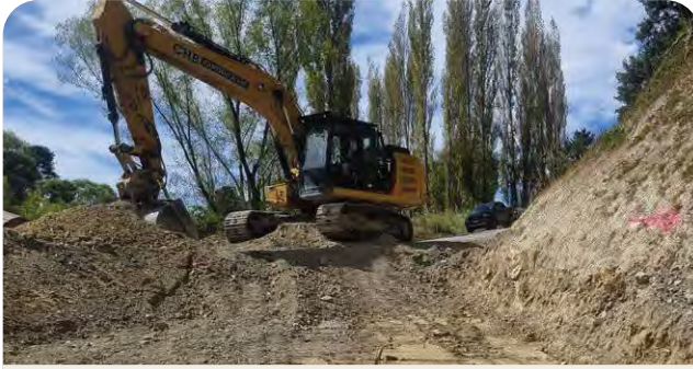
Access to the construction site is mainly from the Maraekākaho side of the gorge.

A temporary solution to replace the cyclone-damaged culvert on Kererū Gorge Rd was not possible due to the complexity of the site and the extent of the damage. The ongoing disconnection for the community has meant the rebuild here has been prioritised. It is the first of the major culvert/bridge rebuilds to get underway.