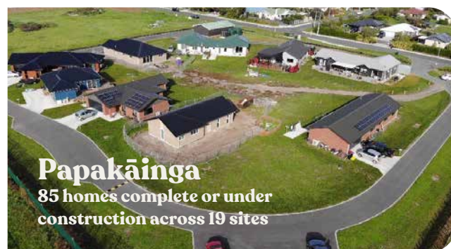
Papakāinga 85 homes complete or under construction across 19 sites

Although not part of the initial pilot, significant work has been undertaken to understand and address the needs of the homeless in Hastings. A joint venture between Council, Hastings Church and Anglican Care Waiapu, supported by the Ministry of Social Development and Te Whatu Ora, has developed a homeless hub in Hastings city, providing wrap-around support – meals, health care and welfare. In addition, Te Taiwhenua o Heretaunga received Government funding to provide accommodation for up to 10 homeless per night, which has been operating since last year.