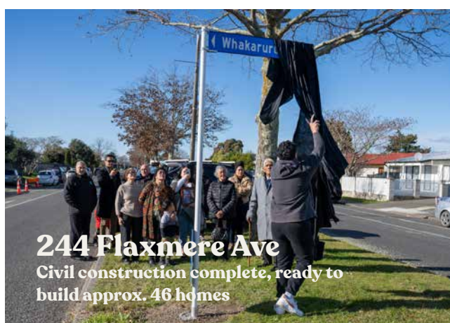
244 Flaxmere Ave Civil construction complete, ready to build approx. 46 homes