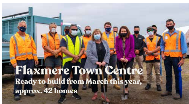
Flaxmere Town Centre Ready to build from March this year, approx. 42 homes