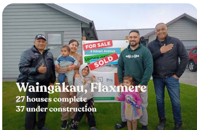
Waingākau, Flaxmere 27 houses complete 37 under construction