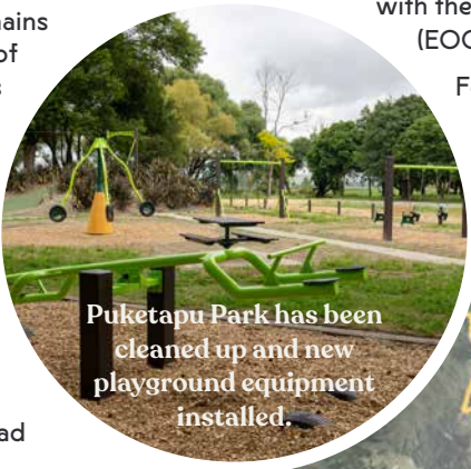
Puketapu Park has been cleaned up and new playground equipment installed.