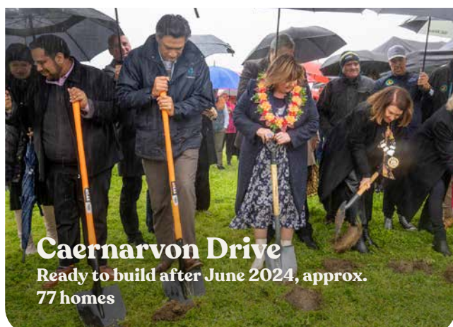
Caernarvon Drive Ready to build after June 2024, approx. 77 homes