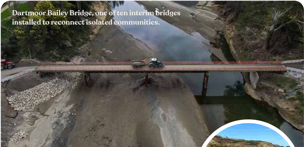
Dartmoor Bailey Bridge, one of ten interim bridges installed to reconnect isolated communities.