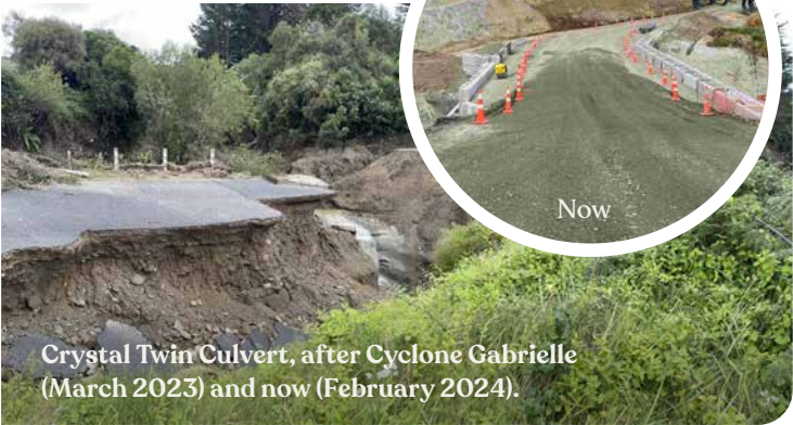
Crystal Twin Culvert, after Cyclone Gabrielle (March 2023) and now (February 2024).