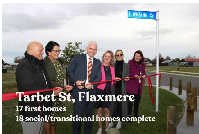
Tarbet St, Flaxmere 17 first homes 18 social/transitional homes complete