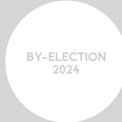
VACANT HERETAUNGA WARD