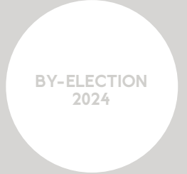
VACANT TAKITIMU MĀORI WARD