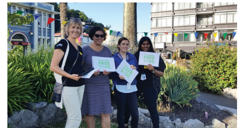
Members of the JAS Reference Group testing the new alcohol free branding at the Napier Fiesta.

Work is underway to create an exciting new brand that will support existing alcohol-free events and encourage more events to go alcohol-free or to have an alcohol-free zone. The JAS Reference Group recently got together at the Napier Fiesta to test the new brand with the public. It is hoped to have the brand available later this year.