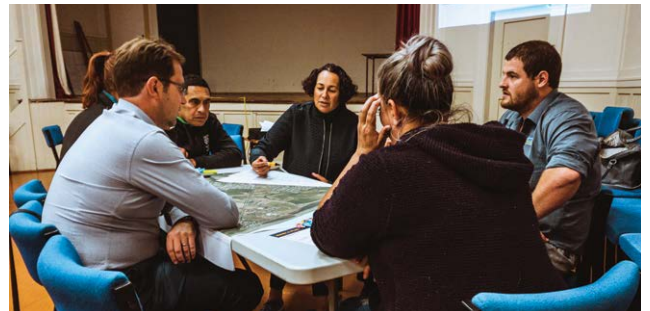
Clive Community members working on their community resilience plan with HBCDEM

In a major emergency, your community may be on its own for the first few hours, or even days. But you won't be alone – you'll be with your family, friends, co-workers or neighbours. A community resilience plan brings community members together, to help coordinate and speed up how they'll look after each other after an emergency.