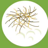
HAIR & NAIL CLIPPINGS