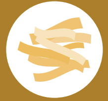
SAWDUST & WOOD SHAVINGS