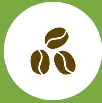
COFFEE GROUNDS & TEA LEAVES