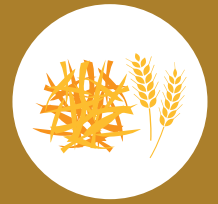
STRAW & HAY