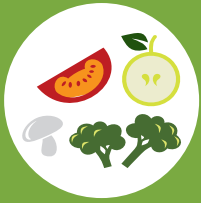
CHOPPED FRUIT & VEGGIE SCRAPS