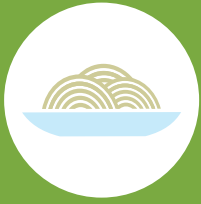
COOKED RICE & PASTA