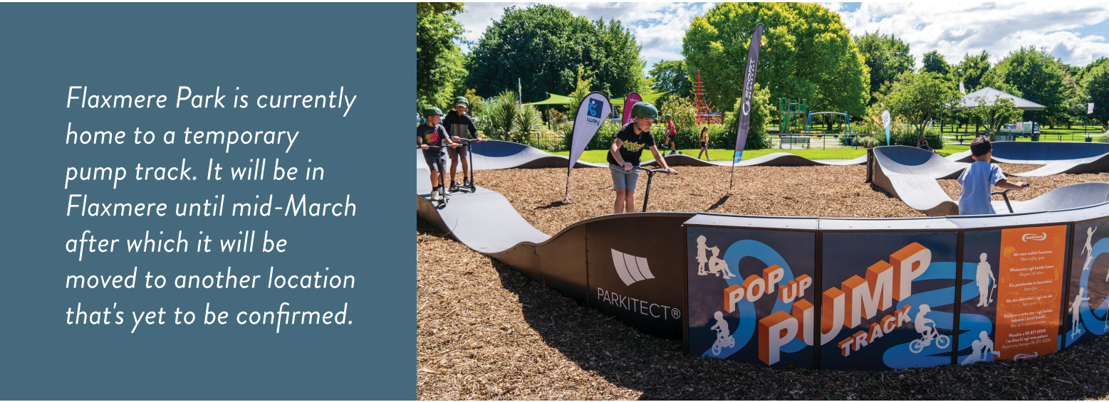
Flaxmere Park is currently home to a temporary pump track. It will be in Flaxmere until mid-March after which it will be moved to another location that's yet to be confirmed.

Keep up to date with progress at www.hastingsdc.govt.nz/flaxmere/flaxmere-homes