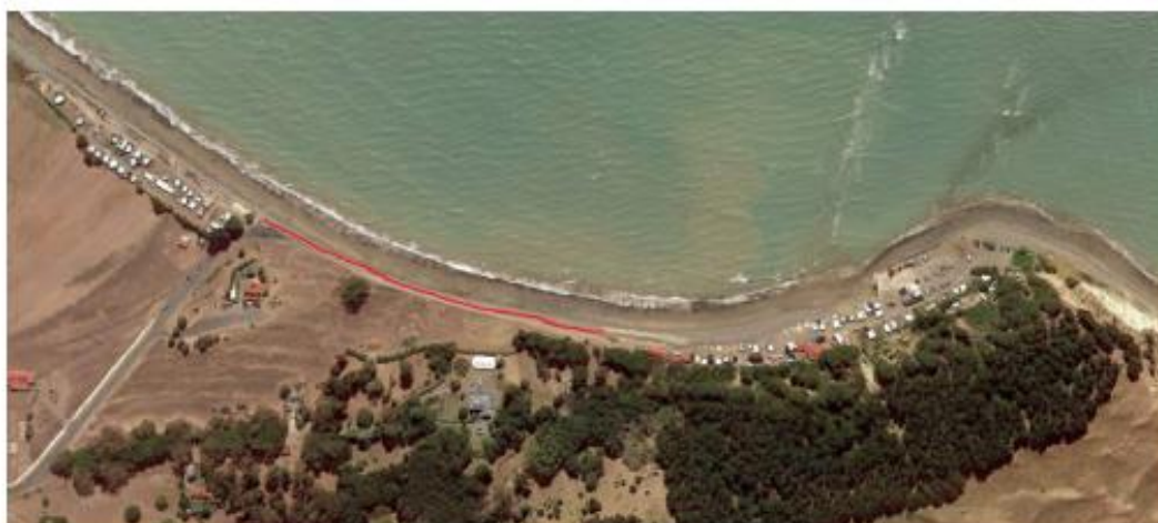
Figure 2: Location of Proposed Revetment